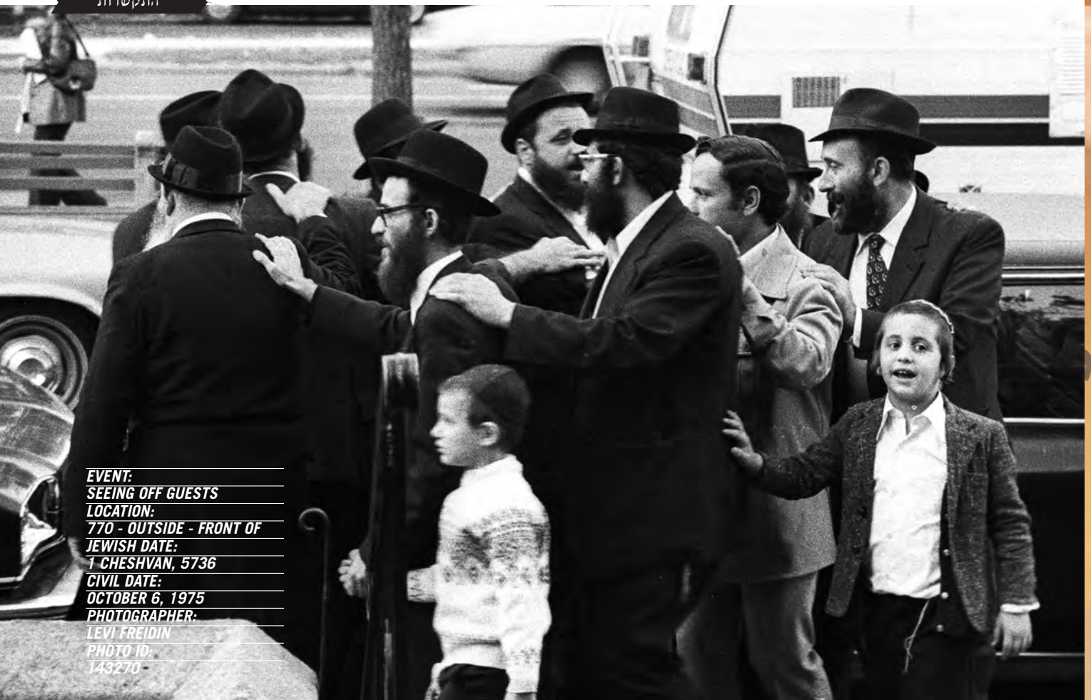
EVENT: SEEING OFF GUESTS LOCATION: 770 - OUTSIDE - FRONT OF JEWISH DATE: 1 CHESHVAN, 5736 CIVIL DATE: OCTOBER 6, 1975 PHOTO ID: 143270