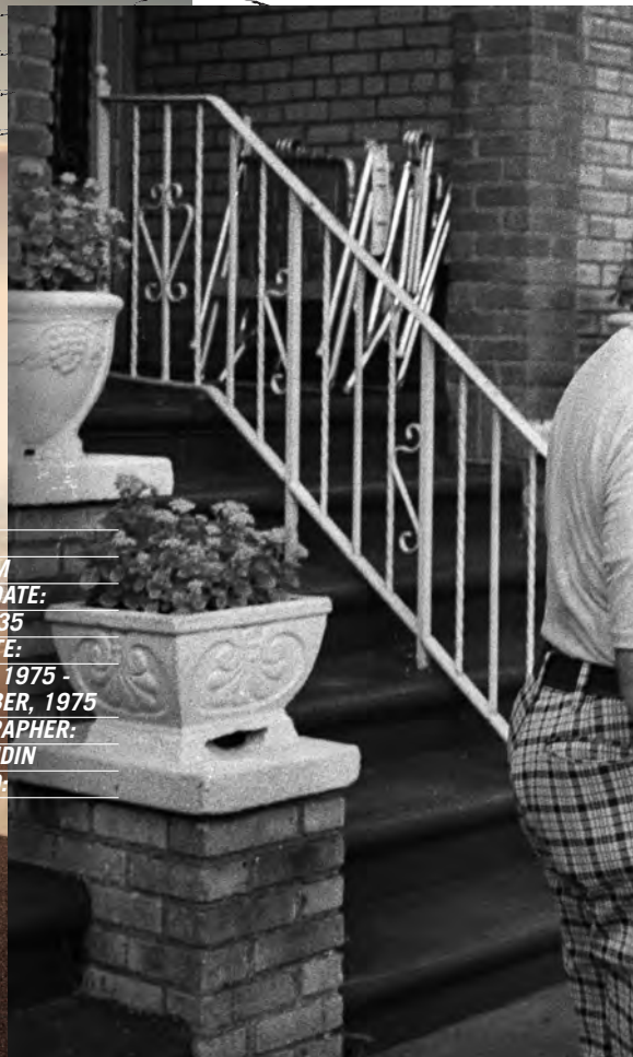
EVENT: MIVTZOIM JEWISH DATE: ELUL, 5735 CIVIL DATE: AUGUST, 1975 - SEPTEMBER, 1975 PHOTO ID: 140529